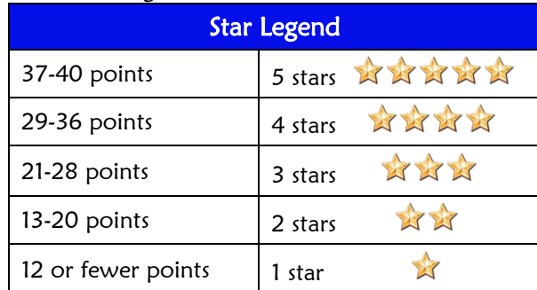
Legend for Toddler CLASS Results